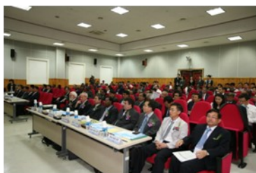
Global Forum p.6