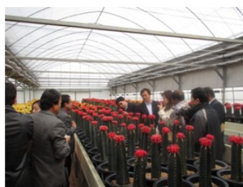
At the Cactus Research Station (Goyang, Korea)

Participants from each member country made 30-minute country report presentation.. After the MOU signing ceremony, participants visited the Cactus Research Station in Goyang City, the Changdeokgung Palace and Namdaemun Market.