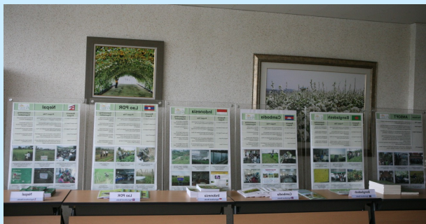
Agricultural Technology Books Exhibition at ITCC, RDA

This activity aimed at facilitating the publication and distribution of agricultural technology books to provide agricultural technologies directly to local farmers and share educational materials in their local languages or English.