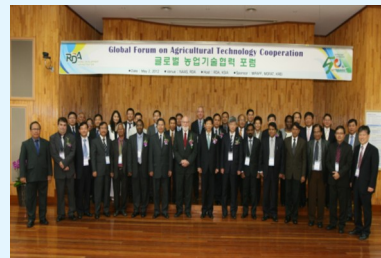
Participants of Global Forum