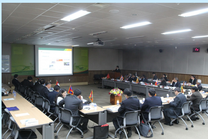
Presentations on outstanding research projects

The Assembly listened to the following presentations: