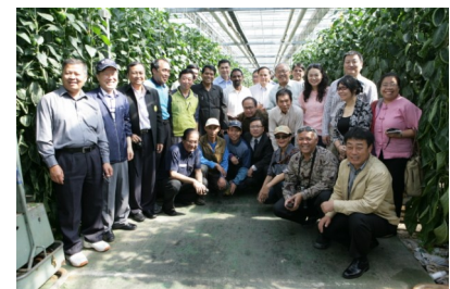
Paprika Farm in Jeju