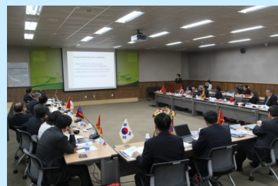
Presentations of Projects