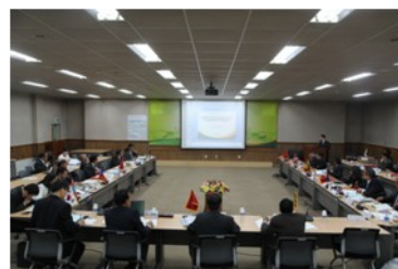
2nd General Assembly in Suwon. p.2