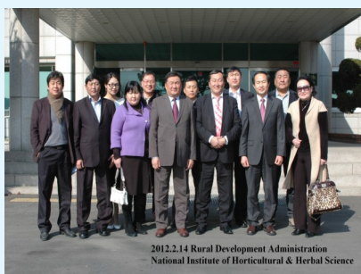
At the National Institute of Horticultural & Herbal Science