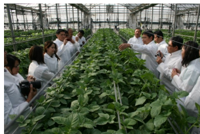
Foundation Seed Production Center, Jeju Province