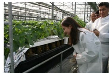
Field Visit p. 6

Visit the AFACI Website at : www.afaci.org