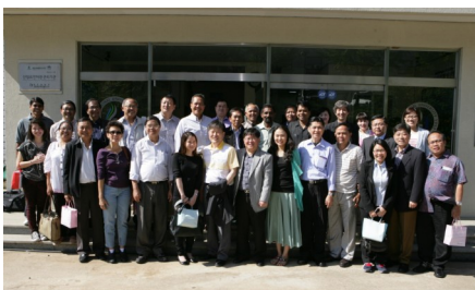
Subtropical Horticulture Research Institute of Jeju Nat'l University