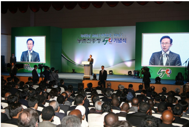
President Lee, Myung-Bak delivering his Congratulatory Address for RDA's 50th Anniversary

R ural Development Administration( RDA) celebrated its 50 th Anniversary on 2 May 2012 at the Green Revolution Memorial Hall of RDA, Suwon.