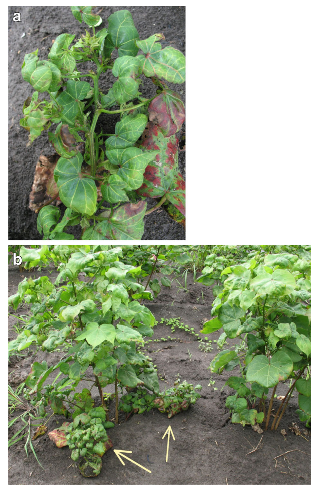
Fig. 1 a Severe symptoms of cotton plants infected with CLRDV from Thailand showing down curling of leaves, stunted growth and zig-zag appearance of stem; b prostate growth of severely affected plants (shown by arrows )

described for cotton leaf roll from Thailand. They were collected from two locations in Brazil; from G. hirsutum (isolates Q3523 and Q3524) and G. mustelinium (isolate Q3525) from Santa Helena de Goiás, Goiás, and from G. hirsutum (isolates Q4625 and Q4631) from Primavera do Leste, Mato Grosso.